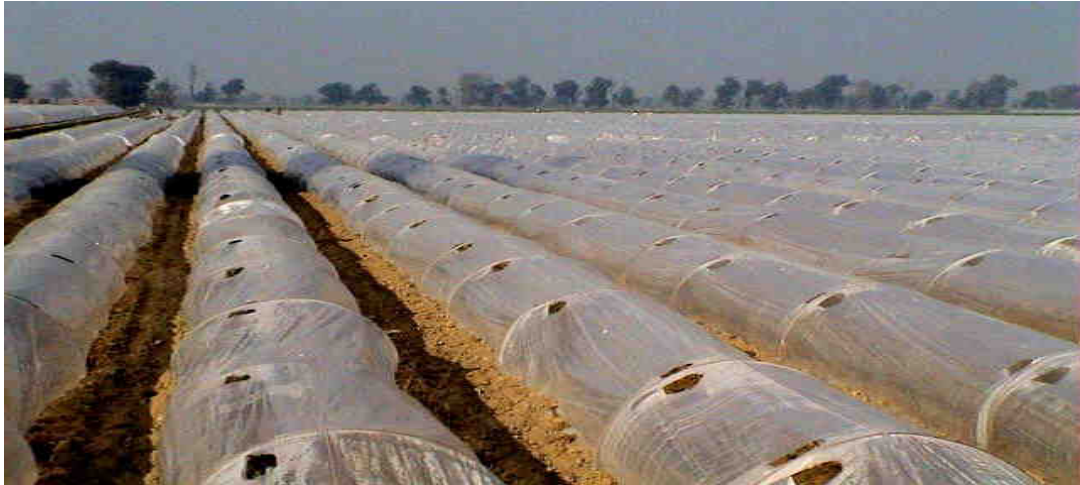
Figure 6-2 Support structure in low tunnels

Each tunnel structure will then be covered by 0.04-mm thick and 10 feet wide plastic sheet. Approximately 25 tunnels can be constructed on an acre of land depending on the type of vegetable, i.e. watermelon, muskmelon or pumpkin.