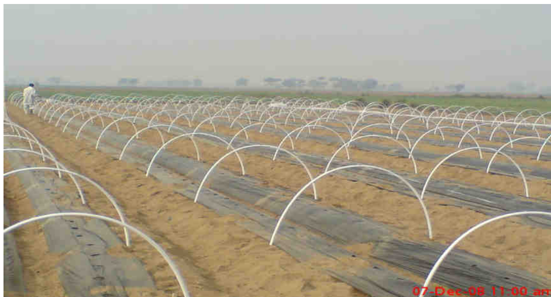
Figure 6-1 Low Plastic Tunnels 3

The cost of such tunnel amount to Rs.30,000 per acre excluding the cost related to plastic used as a shield (Cover) and mulch.