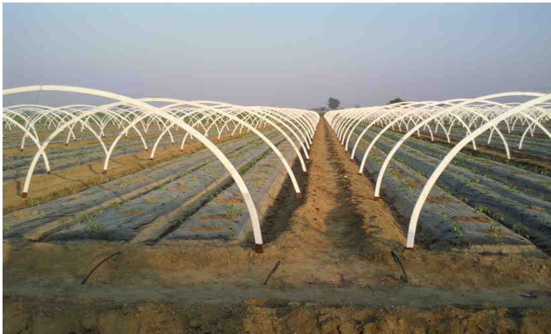
Figure 6-1 Walk-in Plastic Tunnels 3