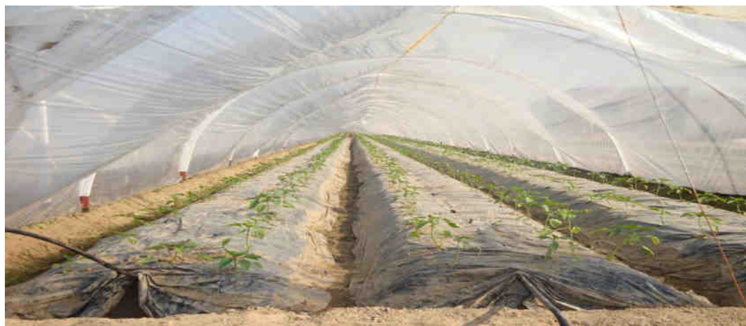
Figure 6-2 Support structure in walk-in tunnels

Each tunnel will be 200 feet long, 6.5 feet high and 12 feet wide. The tunnel is built by 1 ½ inch diameter plastic pipe (PVC material) of 20 feet length, in half moon shape. The plastic pipes are put at regular intervals of approximately 10-15 feet. Each tunnel structure will then be covered by 0.06 mm thick and 20 feet wide plastic sheet. Approximately 13 tunnels can be constructed on an acre of land depending on the type of vegetable, i.e. cucumber, bitter gourd and hot pepper.